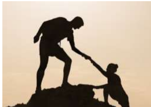
“If My People...”

8:30am & 10:30am Services visit www.rumcoh.org